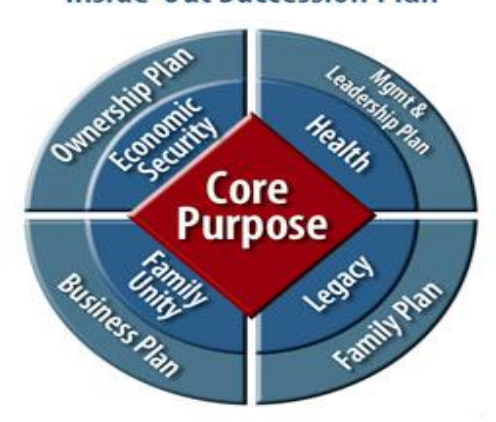
Figure 1.1: Succession Plan Inside-Out Succession Plan

Because one of the main problems that family-owned businesses in Palestine face is the succession of ownership and management to the subsequent generation (Sabri, 2008), this study aims to investigate the factors that affect family-owned businesses succession plan and to analyze the factors that affect the succession output as indicated in Figure 1.1.