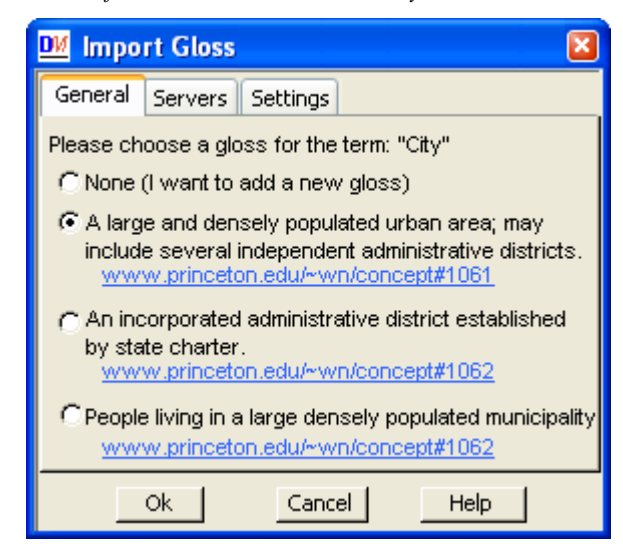
Figure 3: Incorporating existing lexical resources in gloss modeling.

just any lexical resource can be adopted. The lexicon should provide a clear discrimination of word/term meaning(s) in a machine-referable manner, much like the synsets in WordNet.