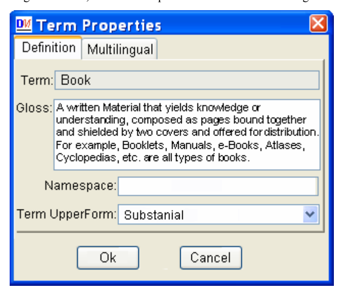
Figure 2. Concept modeling window.

When introducing a new concept, ontology builders should define its gloss. Figure 2 shows the concept-modeling window in DogmaModeler, with an example of the term 'Book' and its gloss.