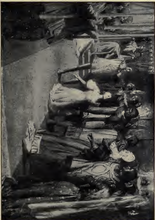
JOAN DISCOVERS THE DISGUISED KING