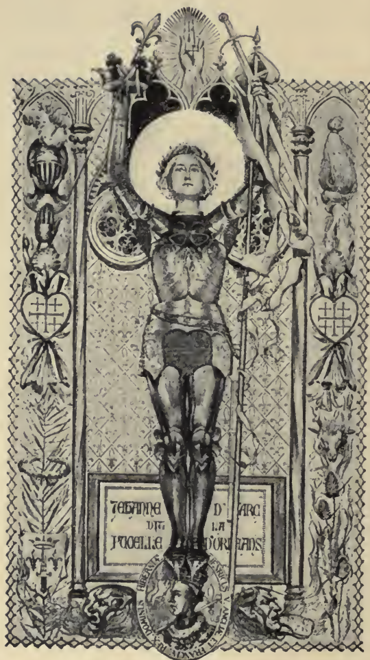
THE MAID OF ORLEANS