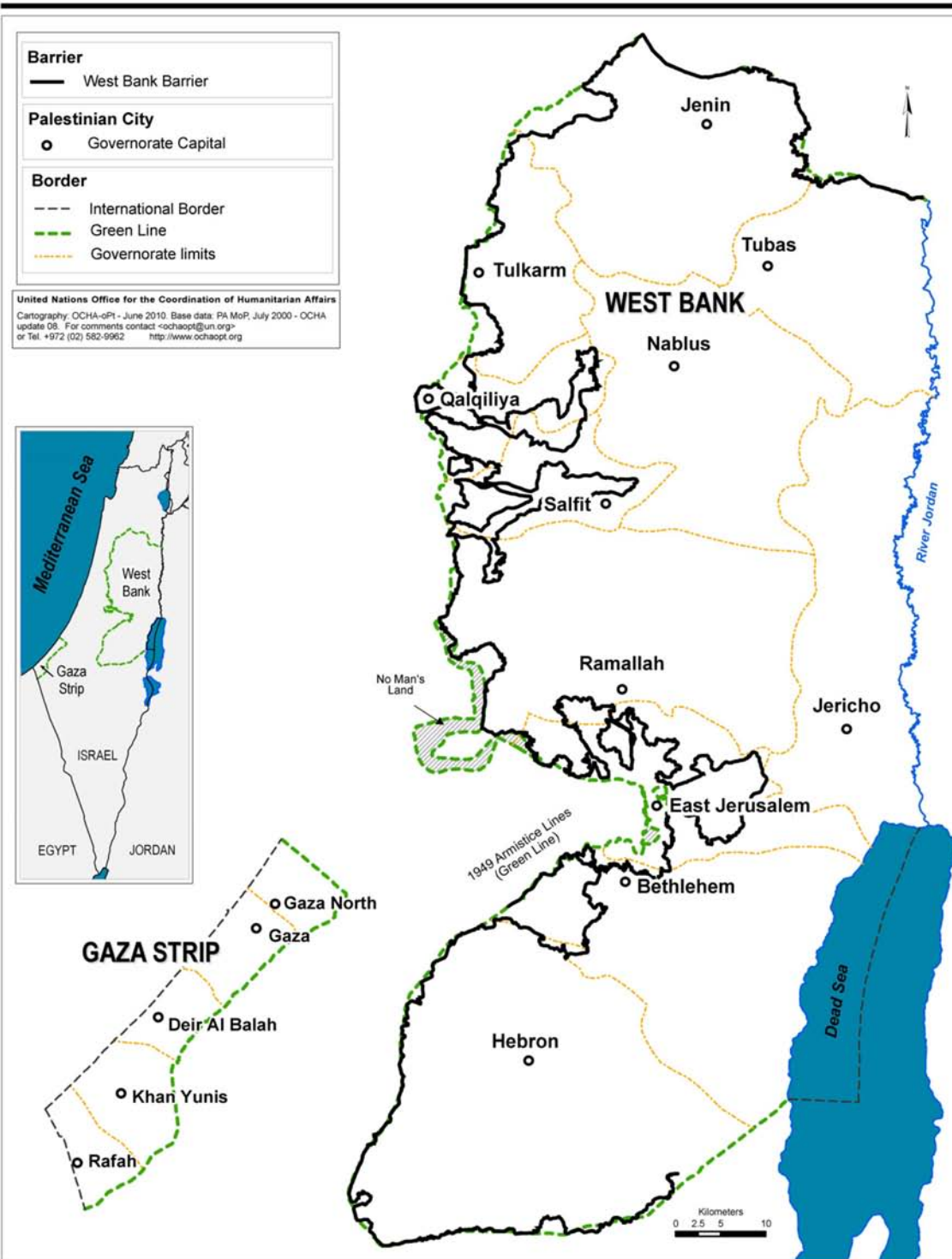
Fig. 2 Map of West Bank governorates