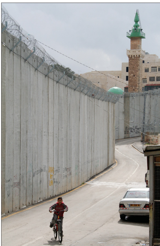
Figure 4: Separation wall in Abu Dis

When food aid and remittances were excluded, the rates rose to 79·4% in Gaza and 45·7% in West Bank. 29 Unemployment in the occupied Palestinian territory in early 2008 was 35·5% in the Gaza Strip and 25·7% in the West Bank. 29 Many of those who are employed work in the insecure, internationally financed public sector or in unpaid family labour and seasonal agriculture. 65 Palestinians from the West Bank and Gaza Strip had been a source of cheap labour for Israel since the beginning of the occupation in 1967. However, this employment and provision of some economic gains for the Palestinians began to change during the first uprising (1987–92). From the early 1990s, checkpoints in and out of Israel became more difficult to cross and workers had to apply for special