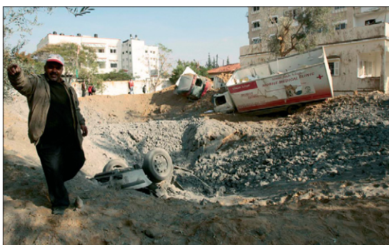
Figure 2: Palestinian health worker surveys damage to mobile clinic destroyed after air strike in the Gaza Strip

The reconstruction of destroyed homes creates emotional stress and economic hardship. In most areas of the