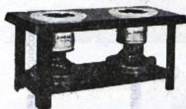
"DUPLO" DOUBLE COOKING STOVE