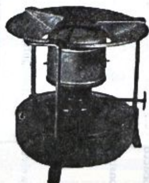
"IDEAL" COOKING STOVE