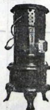
"DALIA" HEATING STOVE

HEATING-COOKING STOVES, BAKING OVENS. GEYSERS, TIN BOXES, HOSPITAL - EQUIPMENT.